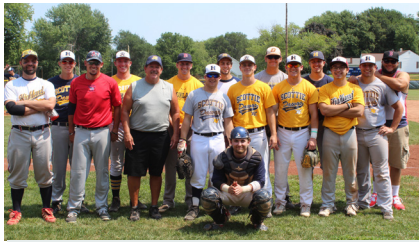
Alumni Baseball Team