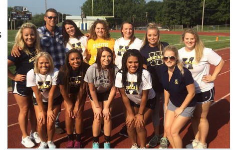
Alumni Cheer/Dance Team

and softball games with volunteers offering grilled hot dogs and other tasty treats.