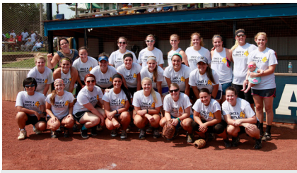
Alumni Softball Team